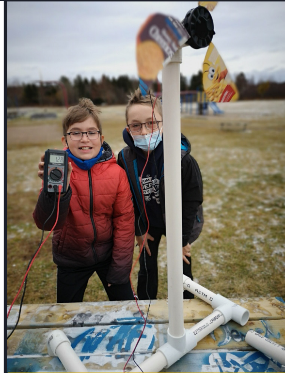
Students from Magnetic Hill School exploring wind energy with kits provided by NB Power, in partnership with the COE for Energy.