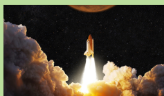
Lift-Off! (Gr 6-10)