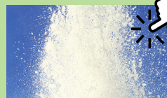
Volcano! (Gr 3-5)