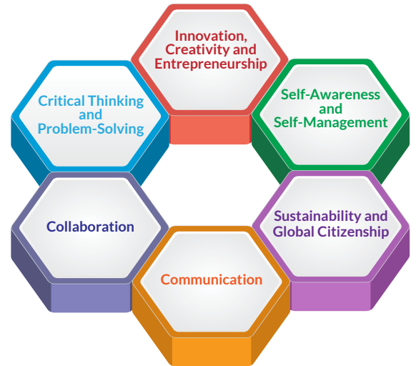
FOUNDATIONAL SKILLS: LITERACY AND NUMERACY, AND CORE LEARNING IN SUBJECT AREAS